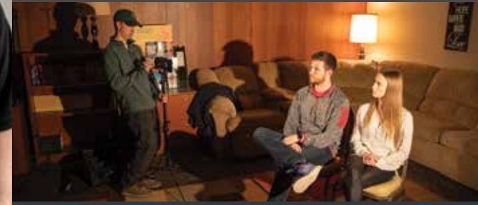
tell the story of a historic Muncie church and its impact on the community