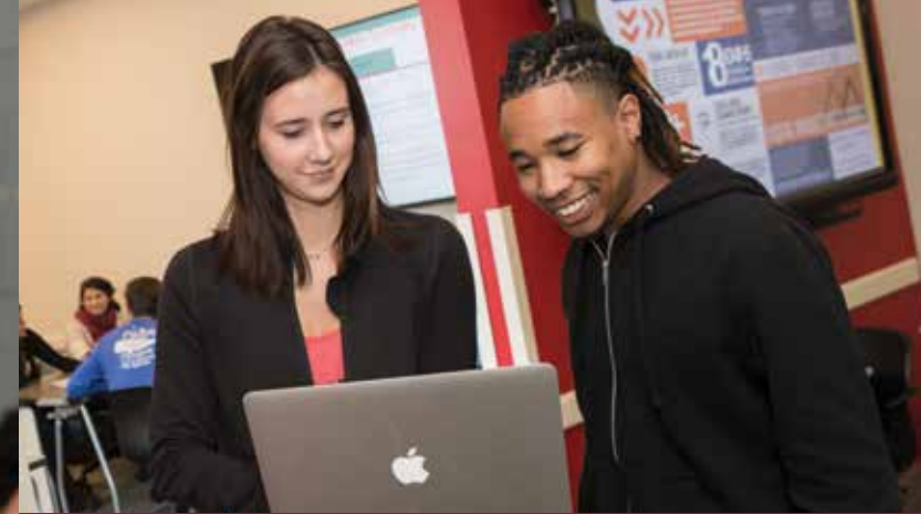
implement social media marketing strategies for businesses and communities in the region through the Center for Advancement of Digital Marketing and Analytics (CADMA)