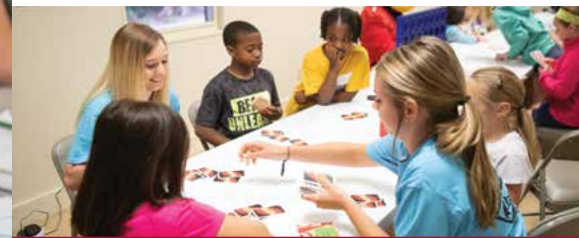
prepare for careers in the classroom by working at a summer camp to help under-resourced children retain academic skills