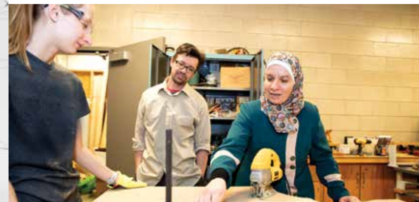
design rooms and furniture for children with special needs