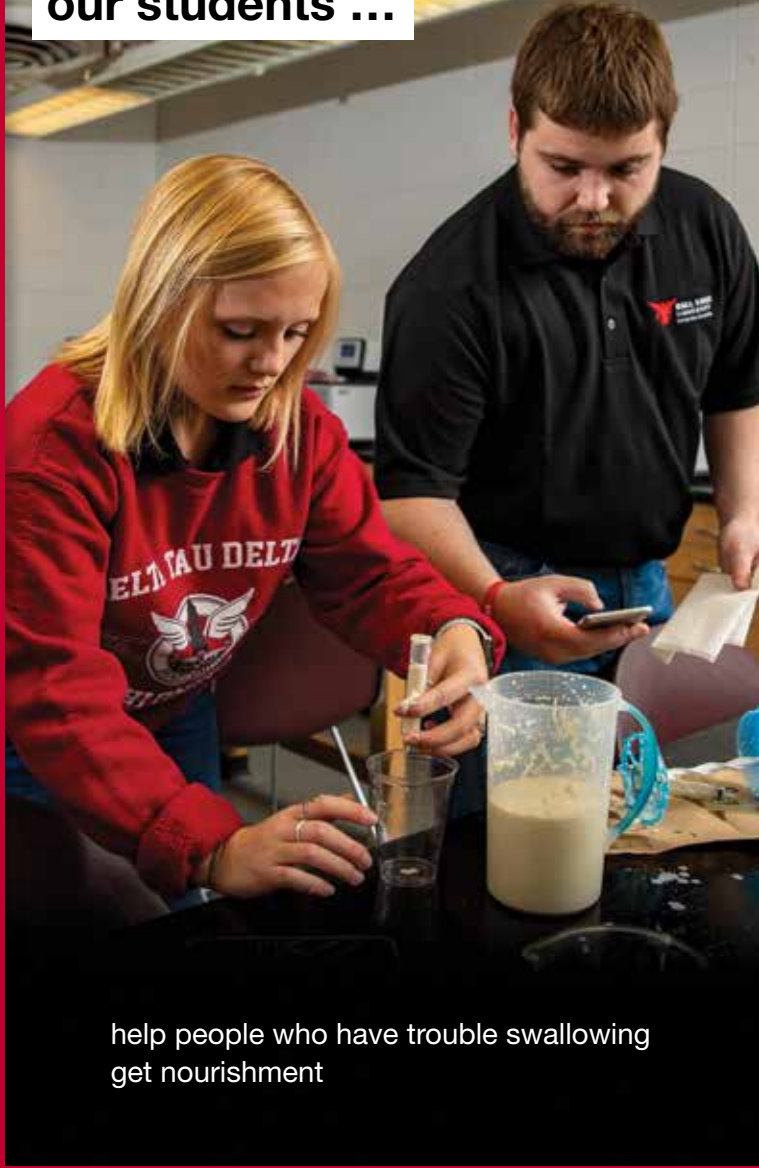
help people who have trouble swallowing get nourishment

126 Immersive learning projects in one year