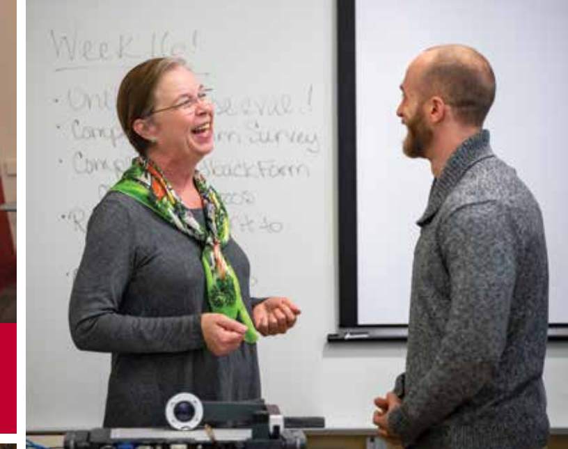
become exceptional, socially responsible technology leaders through our Center for Information and Communication Sciences (CICS), named "Outstanding Program of the Year" by the Information and Telecommunications Education and Research Association (ITERA)