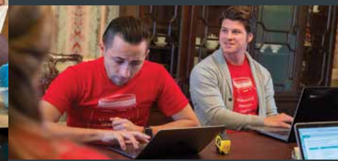
manage a boutique housing for medical students