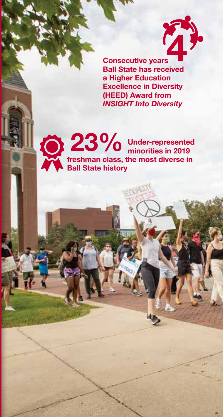
Ball State supported a peaceful campus-community march for civil rights—one of the largest in Muncie’s history.

The Ball State community strives for freedom, liberty, and equality for all people. Our students, our faculty and staff, and our friends and neighbors have demonstrated courage, a passion for justice, and an unwavering commitment to peaceful but profound change. We are united in this vital cause.